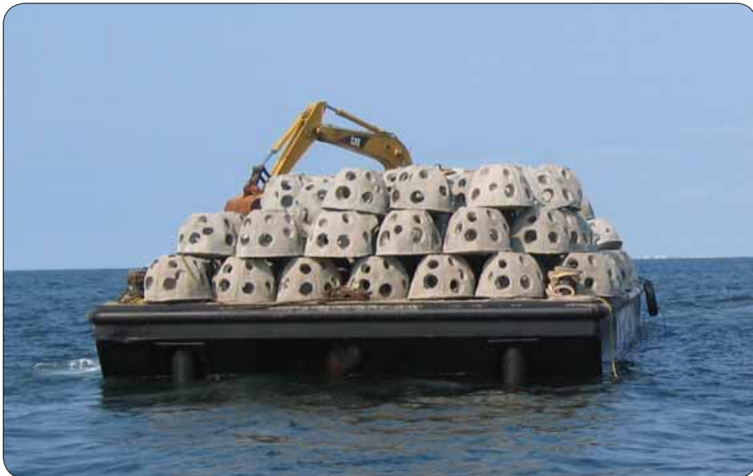
A load of reef balls on a deck barge awaiting deployment.

FACT: Great Egg reef site is home to only one vessel. The Rothenbach II is a 165' tanker barge.