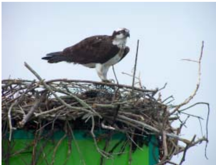
Banded breeding adult nesting on channel marker in Cape May Harbor in 2007

*Thanks also to everyone who contributes to the Endangered and Nongame Species Program by the Check-Off for Wildlife on their NJ State Income Tax, and by buying Conserve Wildlife License Plates!*